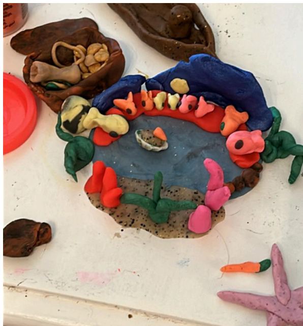
Fish Aquarium- Cate Gr 3