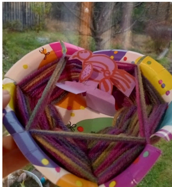
Bird Nesting Weaving- Jasper Gr 1