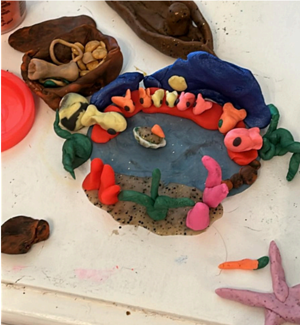
Fish Aquarium- Cate Gr 3