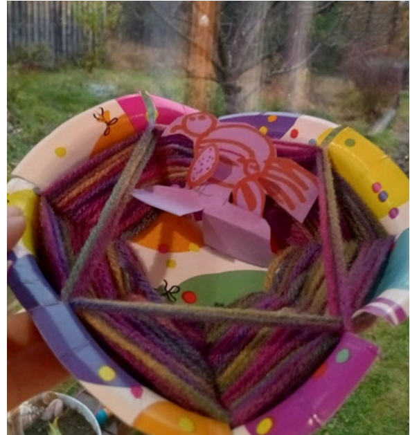
Bird Nesting Weaving- Jasper Gr 1