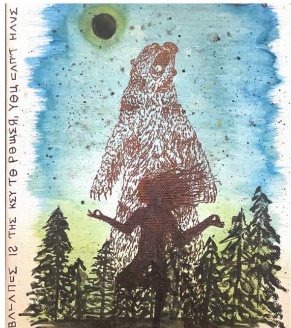
Power- Addison Gr 9