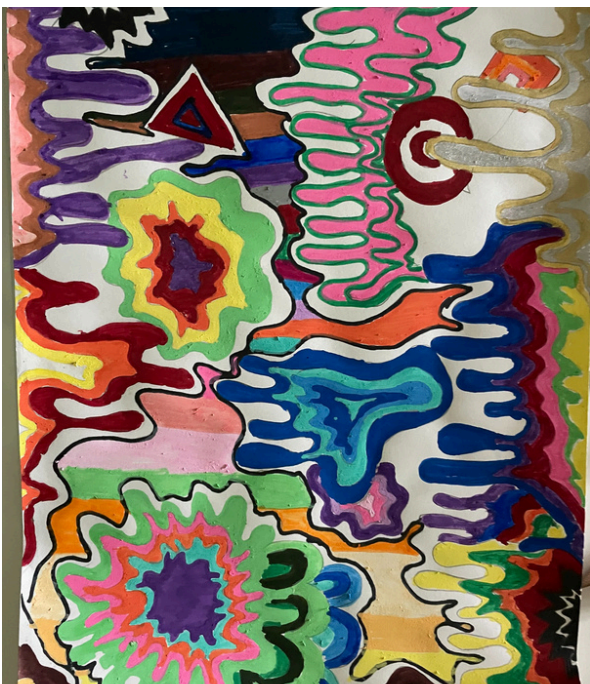
Drip Art- Micah Gr 6