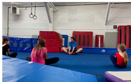
Kicking Horse Gymnastics