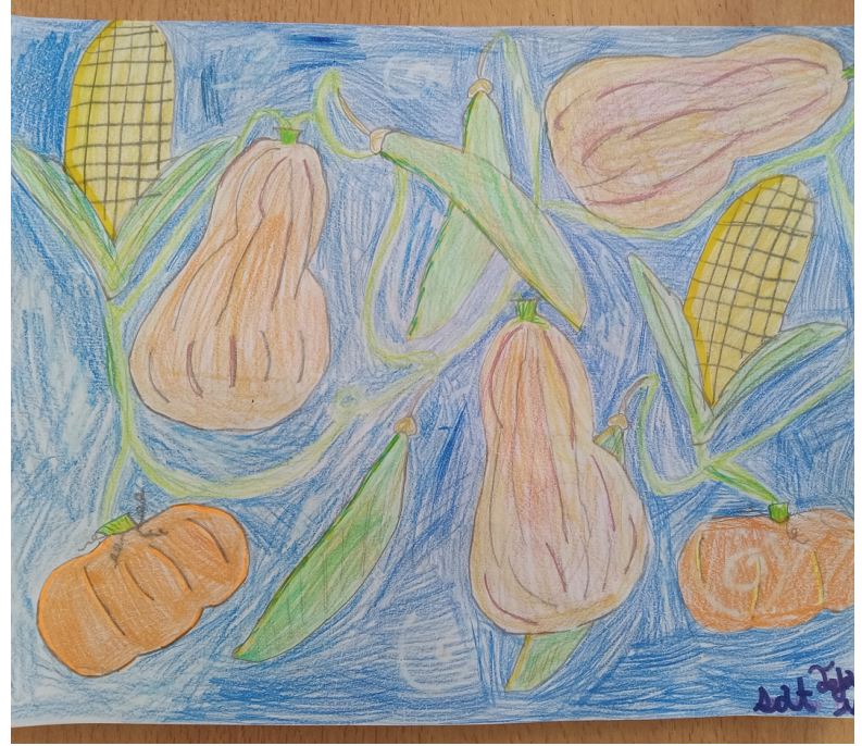
Three Sisters Art Project by: Teja