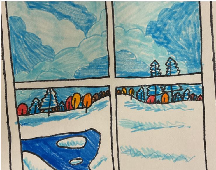
Landscape Art Project by: Jael