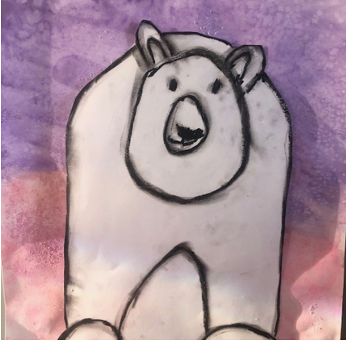
Polar Bear Painting by: Evo