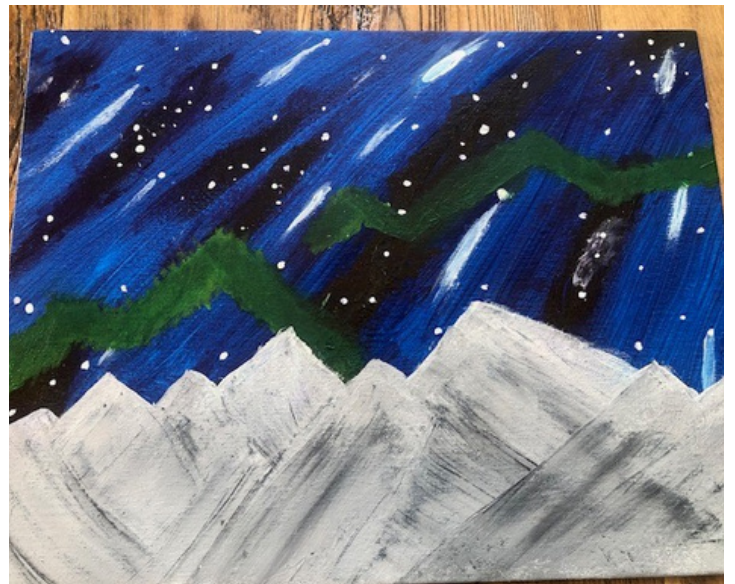
Northern Lights by: Zeno